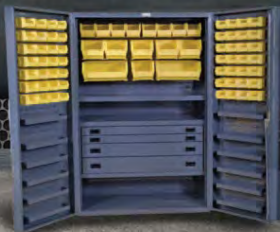
Consumable Cabinets Control Cost & Reduce Freight