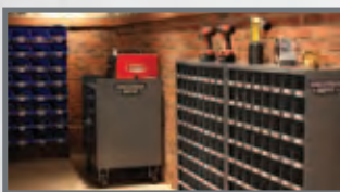
Vendor Managed Inventory

Bolts Nuts Machine Screws Socket Products Washers Specials Rod Pins