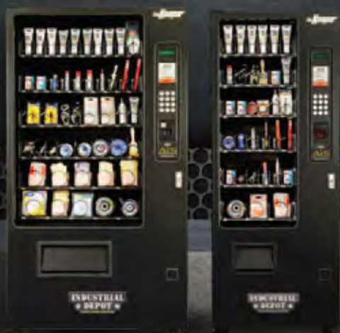
The New Industrial Vending Systems

LEAN MANUFACTURING SUPPORT ON YOUR PARTS, COMPONENTS & CONSUMABLE ITEMS SERVICE SINCE 1973